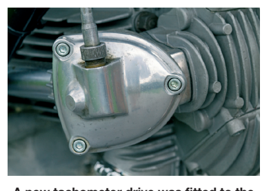
A new tachometer drive was fitted to the front cylinder head during 1973. This was for Veglia or Smiths instruments.

A new kick-start lever appeared at this time, the rotating pedal located by a ring and pin instead of the Seeger ring, but the shape was unchanged. As the supply of electronic tachometers dwindled, by the end of 1973 all the tachometers were mechanical. with a new drive from the front cylinder. Although the drive was now incorporated in the casting, it still failed to solve the problem of oil leaks, and sometimes oil would now leak from the cable connection. Some miles per hour Smiths instruments, with a mechanical tachometer (mainly for the UK and US), retained the earlier floating brass drive. The Smiths tachometer now also included an 8000rpm red line.