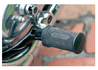
All 750 GTs had these rubber footpegs.

A new kick-start lever appeared at this time, the rotating pedal located by a ring and pin instead of the Seeger ring, but the shape was unchanged. As the supply of electronic tachometers dwindled, by the end of 1973 all the tachometers were mechanical. with a new drive from the front cylinder. Although the drive was now incorporated in the casting, it still failed to solve the problem of oil leaks, and sometimes oil would now leak from the cable connection. Some miles per hour Smiths instruments, with a mechanical tachometer (mainly for the UK and US), retained the earlier floating brass drive. The Smiths tachometer now also included an 8000rpm red line.