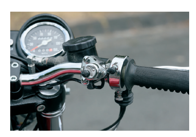
The right Aprilia indicator switch mounted on a specific triangular plate.

the rear manifold identical to the front, angling the carburettor out towards the side cover. There was no longer any room for the regulator under the left-side cover, and this was mounted on a zinc-plated steel plate, with the fuse box in the plastic tool tray.