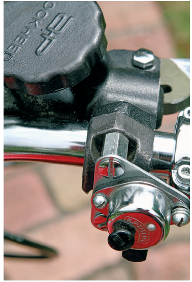
The plate pillars were hexagonal.

the rear manifold identical to the front, angling the carburettor out towards the side cover. There was no longer any room for the regulator under the left-side cover, and this was mounted on a zinc-plated steel plate, with the fuse box in the plastic tool tray.