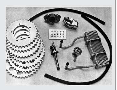
A racing uprating kit was available for the 750 SS.