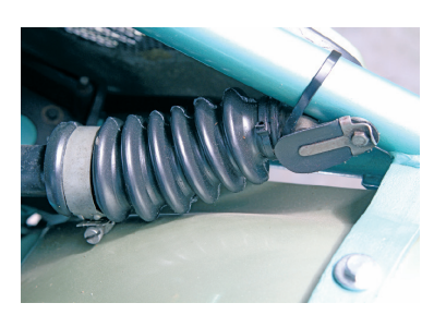
The crankcase breather for the 750 SS (and some 1974 750 Sports), included a bellows and flapper valve.

two degrees less than that for the 750 GT. The Super Sport ignition leads were black, not the green plastic-coated type of the 1973 750 SS, but with the same KLG plug caps. All 1974 Super Sports had the higher domed rocker covers that were designed for the 860 with its screw and lock nut valve adjustment.