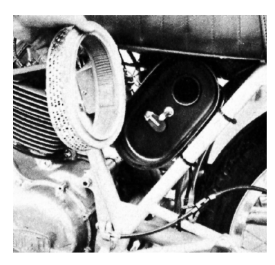
The engine breather valve exited into the rear air filter box.