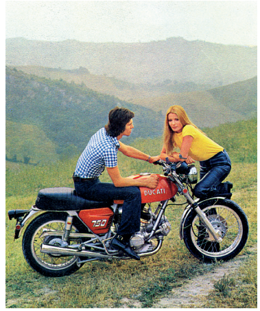
A factory publicity photo of the early 750, this version in metalflake red.

numbered 690, with the initial 100 probably produced in July, before the annual summer break. Further research indicates 82 750 GTs were produced for Italy, 33 for Australia, and 30 for the USA during 1971. Most of these were the regular production series (after engine number 750101). Yet even after the 750 GT went into regular production it was never really mass-produced. With a total number