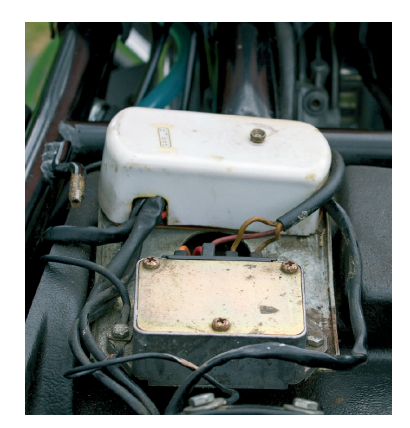
With the Dellorto carburettors the regulator moved to a plate under the seat next to the fuse box.

engine number 753700 the 750 GT gained Dellorto PHF 30 AD and AS carburettors (D for Destra, and S for Sinistra, right and left). These new style carburettors featured accelerator pumps, and included polished aluminium float bowls (retained by 14mm nuts) and metal banjos. The intake manifolds were now aluminium,