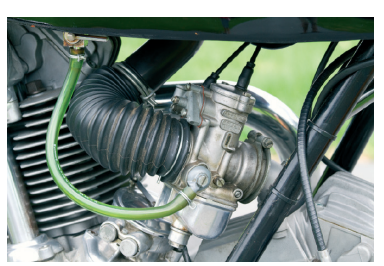
Dell-Orto PHF 30A carburettors were fitted towards the end of 1973, but the pleated plastic air intakes remained.