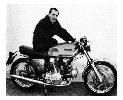
Ducati's great engineer Fabio Taglioni was responsible for all the significant models until 1985. Here he is, towards the end of 1970, with an early 750 prototype.

All the Ducati models featured in this book owe their existence to the great engineer Fabio Taglioni. Without Taglioni, it's unlikely that Ducati would be where it is today as a motorcycle manufacturer, and its current success has been built very much on the achievements of the 1970s. When Taglioni joined Ducati from Mondial in 1954, the motorcycle production program centred around the small capacity Cucciolo. These motorcycles and mopeds were ideal for basic transportation, but were very limited in any other way. Taglioni wanted to build racing and sporting motorcycles, and had an extraordinarily creative and fertile engineering mind. The success of Taglioni's designs led to the success of Ducati as a company, and the early history of Ducati as a motorcycle producer is also the story of Taglioni's involvement. So prolific was he that not every design may have been excellent, but the best were unequalled. And Fabio Taglioni considered his best design over a forty-year association with the company was the beveldrive V-twin. Not only is that engine a truly magnificent design, but its success contributed to Fabio Taglioni's reputation as one of the all time great motorcycle engineers.